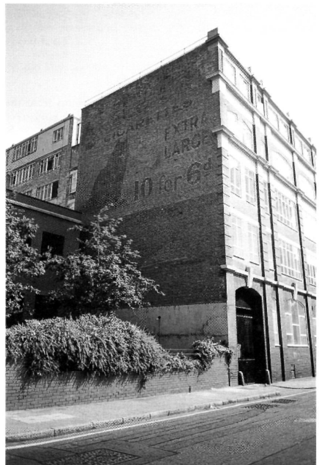
Fig 2. Dingley Rd. London EC1. Imperial Tobacco's York Road factory. The advertisement, for Black Cat cigarettes, evidently dates from just after the Second World War

c.1947, this building was the Imperial Tobacco Co's York Road factory, 1904–1962.