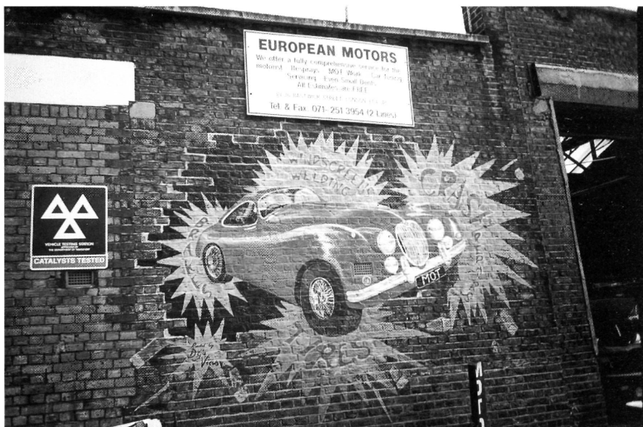
Fig 1. No. 30-36 Bastwick St. London EC1, early 1990s. During the past few decades businesses specialising in repairing cars have probably been the type of enterprise most likely to use painted advertisements, though in recent years they seem to have been overtaken by private nurseries.

that "the most excellent and superb patent razors are sold here". 3